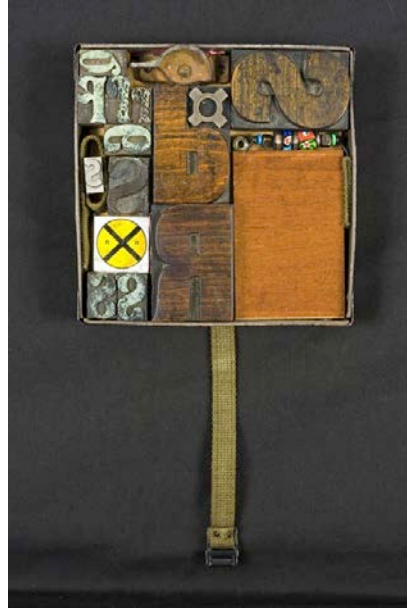
WAR IS NOT THE ANSWER: Found Objects Construction (reinvisioned); H: 52X W:16XD:13” (w/pedestal); $ 750.00; 2014